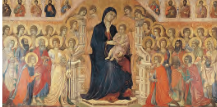
MAESTA’ BY DUCCIO DI BUONINSEGNA

Faced in black and white marble, the cathedral entirely dominates the square. Designed by Giovanni Pisano, the facade is a masterpiece of the Romanesque Gothic style. An impressive interplay of black and white is also a feature of the interior, where the columns are offset by the blue of the vaulted ceiling and the splendidly decorated floor. Composed of 56 images of mythological figures and Old Testament scenes portrayed in inlaid marble, it was created between the years 1379 and 1547, and is only visible in its entirety a few months of the year. Other works of art of remarkable importance