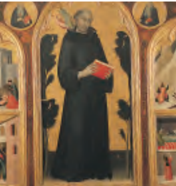
THE BLESSED AGOSTINO NOVELLO BY SIMONE MARTINI

The main streets of the Terzo di Città begin in Piazza Postierla, which the Sienese refer to as the “Quattro Cantoni”, or Four Corners. Not only does this square harbor the little fountain of the Contrada dell’Aquila, but it also features the smallest window in the world, on the facade of the palazzo on the