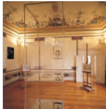
AN INSTALLATION IN PALAZZO DELLE PAPESSE

The eagle that features on the mullioned windows belongs to the coat of arms of the powerful Marescotti family, who had the first part of the palazzo built in the 12th century. Later additions to the building enhanced its strategic importance, to the extent that the tower is said to have been used as a vantage point in 1262 to provide the Sienese with a blow by blow account of the victorious Battle of Monteperti. During its long history the property has changed hands several times, finally to be acquired by the Chigi-Saracini family in 1877. The last scion of this noble stock, Count Guido, made the palace over to the prestigious Accademia Musicale Chigiana that he had founded in 1932.