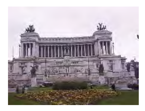
Figure 7 - Vittoriano

The square has origin in the fifteenth century and we can find on it some work of art of great importance like Palazzo Venezia, the first example of Renaissance civil building, started in 1455 on Leon Battista Alberti's model. In the centuries Palazzo Venezia has been used for different purposes until becoming, in the Fascism's twenty years, the meeting place of the Great Council. The palace also contains the Basilica of St. Mark's. Inside the Museum of Palazzo Venezia we can admire important painting works, valuable ivories and jewelleries all kept in the Altoviti Hall.