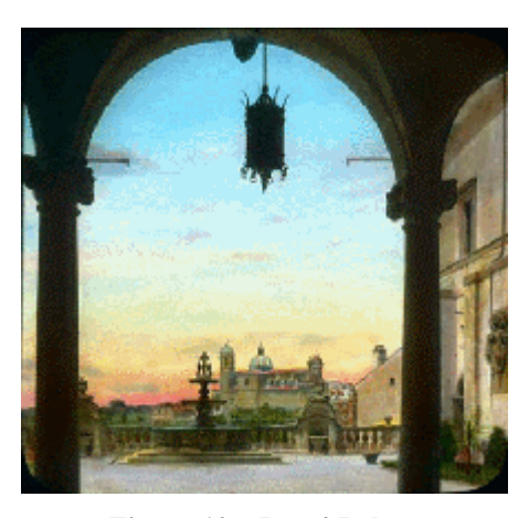
Figure 10 - Pope' Palace

Piazza del Plebiscito is the city centre where the three palaces of Podestà, Prefecture and Priors are located. The latter one was raised in 15th century by Sisto IV. Piazza S.Lorenzo is overshadowed by the Cathedral built in 12th century containing also the sarcophagus of Giovanni XXI, a baptismal basin realized by Francesco d'Ancona, and the Madonna della Carbonara. The church of S.Maria Nuova is one of the oldest in town. It gives visitors the chance to contemplate both the pulpit from which San Tommaso d'Aquino preached and a collection of the main local painters' works from 14th to 16th century, besides the longobard garth.