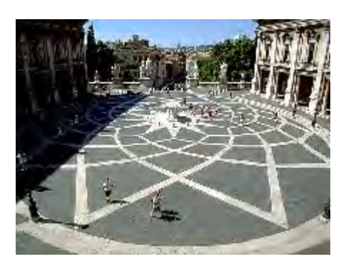
Figure 8 - Campidoglio

the beginning of 1563 by Michelangelo, to whom succeeded Giacomo della Porta. Still by Michelangelo is the planning of Palazzo Nuovo. The palaces contain the Capitoline Museum that was born in 1471 when Sixtus IV donated the bronzes kept in the Lateran to the city of Rome. To these were added in 1773 the Albani collection and other works of art. Inside we can also find the apartment dei Conservatori, that contains some very important works like the statues of Urban VIII, by Bernini, the ones of Innocent X, the Spinario, the portrait of Brutus and the famous Romolus and Remus wolf, symbol of the city, to which were added the twins in the fifteenth century. In the Museum of Palazzo dei Conservatori we can admire other works like the Esquiline Venus, Commodus' bust and the crater of Aristonothos.