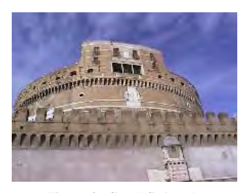
Figure 4 - Castel S. Angelo

After the city's sack by the Saracens in 846, Pope Leo IV made build Castel Sant'Angelo, being the birthplace of the so-called "Leonine city" and making himself the name of Rome's real lord.