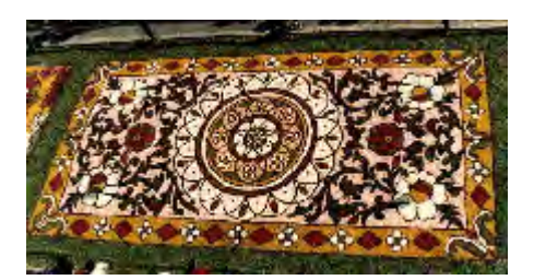
Figure 18 – Floreal carpet

On the Sunday following the Corpus Domini, Via Belardi , the street climbing from the main square up to the church of S. Maria della Cima , is totally covered with a varicoloured flowers and leaves blanket, over an area of approximately 2000 square metres. At sunset, on the chime of the bells, the Bishop, carrying the Ostensory, shows up on the church doorway to lead the procession along the floral pathway. People spend the evening in the lit streets of the town, among workshops, games, food and amusements. At the end of the celebration, crews of young people, starting from the upper side where the church stands, walk the pathway down wiping any trace of the ornaments out of the pavement with their foot.