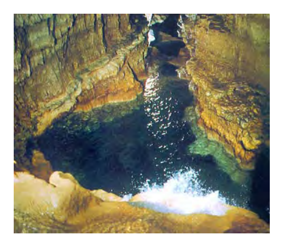
Figure 2 – Blue Lake (Frosinone)

that reach the ocean directly after a relatively short course. Other important lakes, besides the already mentioned lakes of Bolsena, Vico and Bracciano, are the ones of Albano and of Nemi, that are also contained by the craters of two extinct volcanoes in the Alban Hills.