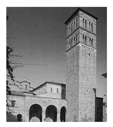
Figure 12 - Duomo

a Madonna del Popolo which belongs to 16th century and the chapel on the other side holding a fresco by Antoniazzo Romano called " la Madonna e i Santi ".