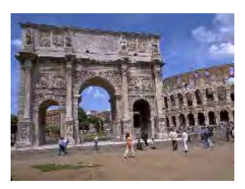
Figure 9 - Arch of Constantine

famous monuments, the city's symbol in the world: the Colosseum. Its real name is Flavian Amphitheatre because the Flavians were the ones that built it, and in the ancient times, it was center of performances with fights between wild beasts and gladiators. Its building was started by Vespasian but it was Titus that inaugurated it in 80, with the famous games that lasted 100 days. The Colosseum was heavily damaged by the earthquake and by the raids that went on for centuries.