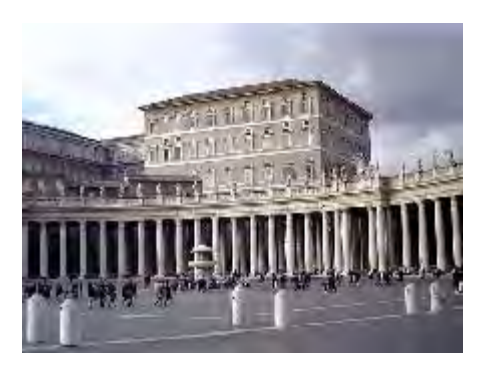
Figure 5 - St. Peter's Place

Alexander II included the Baroque style thanks to Bernini's work that made St. Peter's colonnade and Piazza Navona's fountains. Between the seventeenth and the eighteenth century, the stairway of Trinità dei Monti and the Trevi Fountain were made.