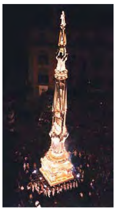
Figure 19 - Macchina of S.Rosa

Her body was perfectly preserved when it was exhumed seven years after her death which occurred in 1251. The corpse was then transferred through a solemn procession, by order of pope Alessandro IV, from the chapel where it was placed to the church of S. Damiano that finally became today's Santuario di S. Rosa , after changing its form and name several times through the centuries.