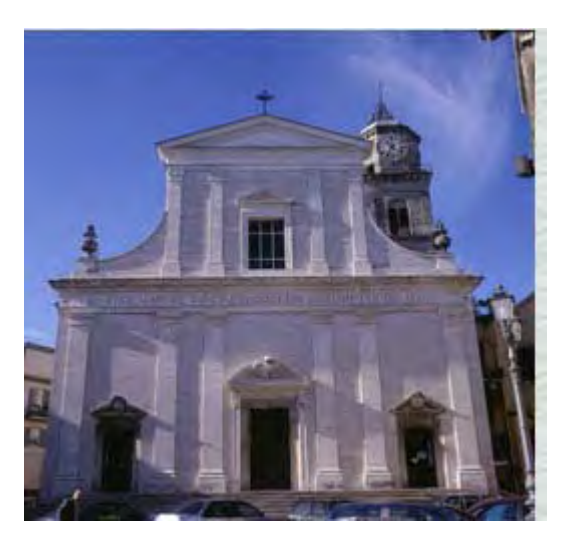
Figure 16 - Cathedral

This volscian town carrying the name of Frusino , was conquered by M.Furio Camillo in 386 B.C. and then rose up against Rome together with the people called ernici in 306 B.C. . Following a period of settlement during the imperial era, the town was ruled by the Byzantines and the Longobards. It was then conquered by Charles the Great in 798 B.C. and thus donated to the Church. The town has later been ruled by the Saracens, the Normans, the Suevians and the Angevins before being laid waste by an earthquake in 1350 and rebuilt in 1527. After further historical events mainly concerning the Lansquenets, the French and the Spanish, it defected to the pontifical rule and was instituted capital of the provinces of Campagna and Marittima.