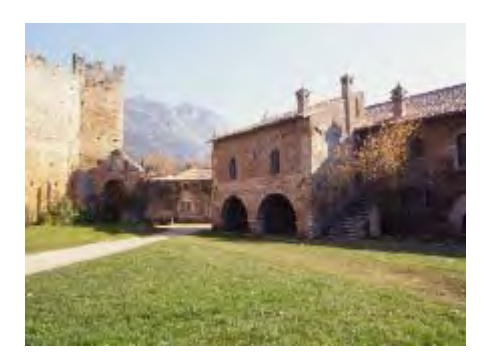
Figure 15 - Ninfa

It was founded in 1932 on a territory inhabited by a thin neighbourhood while the drainage was under way. The town, which is situated in the heart of the Roman country, was built according to the fascist architecture, as a matter of fact it kept that name until the fall of the dictatorial regime. Thanks to the fast growth which followed World War II, the city can be considered the second province in its region. As to monuments, it's not really worth visiting Latina since it is far too recent. On the other hand its province offers both attractive shores with lots of seaside resorts and an inland countryside full of places to be visited. Among them the Castello di Ninfa with its nature reserve stands out.