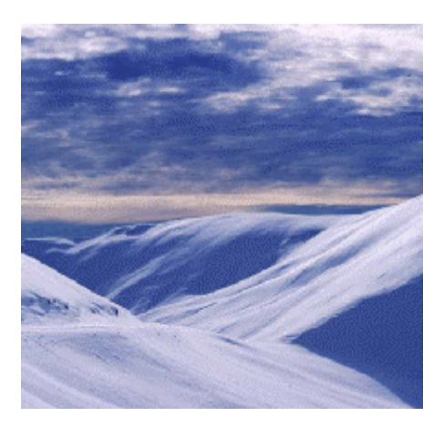
Figure 13 - Terminillo

The most renowned tourist resort in the province of Rieti is the Terminillo , also known as the romans' mountain because of its location; it is, as a matter of fact, the closest skiing resort to Rome.