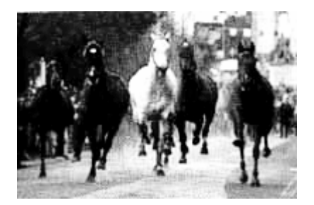
Figure 17 – Horse riding

The imposing voice of the main bell and the Hussars' parade ring up the curtain on the celebrations, early in the afternoon of the last carnival friday. The Re dei Carnevalesi , accompanied by costume knights, settles in town taking from the mayor the delivery of the keys thus assuring five days of revel to everybody.