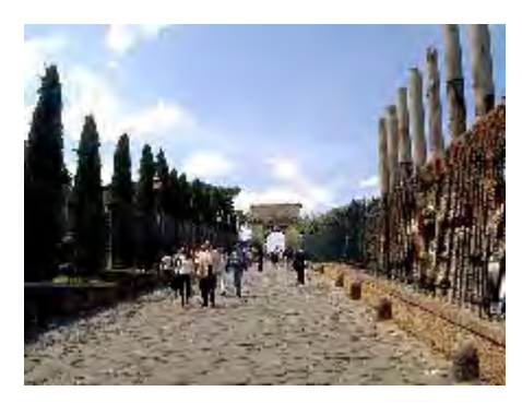
Figure 3 - Fori imperiali

centuries the city gained that grandness and that magnificence still visible nowadays. The most important works: the Tabularium of the Campidoglio, the Theatre of Marcellus, the Imperial Forums whose building was started by the emperor Augustus, the grand imperial Palace on the Palatine wanted by Nero, the Colosseum and the Arch of Titus.