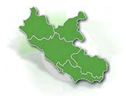
Figure 1 - Lazio

Lazio is famous because it's the Italian region that has Rome. And this certainly makes it an important region at tourist level... but this is not all, in fact it's only a part. Actually Lazio is a region full of culture, history, nature, that gives the tourist what he wants, allowing him to live different experiences and to turn his own vacation in an unforgettable event.