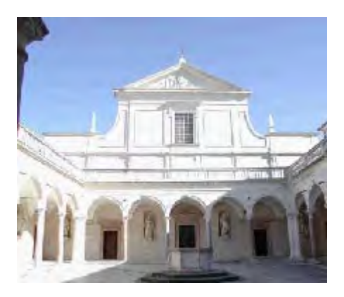
Figure 1 – Montecassino Abbey

Amatrice. Tarquinia, on the northern coast, is one of the largest archaeological centers connected to Italy's Etruscan civilization.