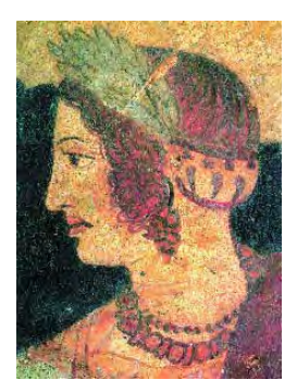
Figure 2 – Etrurian Picture

Latium originally inhabited by the Latins, thanks to the Roman conquests, incorporated the lands of the Ernici, the Equi, the Aurunci and the Volsci, so that it extended its boundaries to the Sanniti, the Marsi and Campania, territory this one that took the name of Latium Novi to be differed from Latium veteres, that indicated Lazio in its original extension.