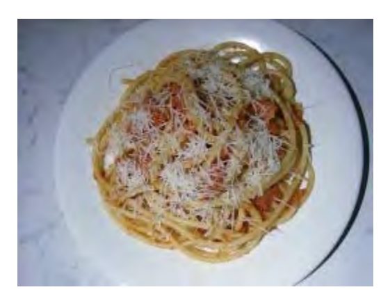
Figure 14 - Amatriciana

mentioning: the spaghetti alla amatriciana , typical dish of the small town Amatrice, the jaccoli , rough spaghetti served dry with a gravy and pecorino cheese topping, the stracci di Antrodoco , pancakes filled with spicy meat and served with cheese and gravy, the maccheroni a fezze , the abbacchio in guazzetto , the pollo spezzettato alla sabinese , sautéed and served with an anchovy, caper and olive sauce dressing. The sweet specialities are: the pizza pasqualina , the maccheroni alle noci and the tozzetti di miele e noci spezzettate .